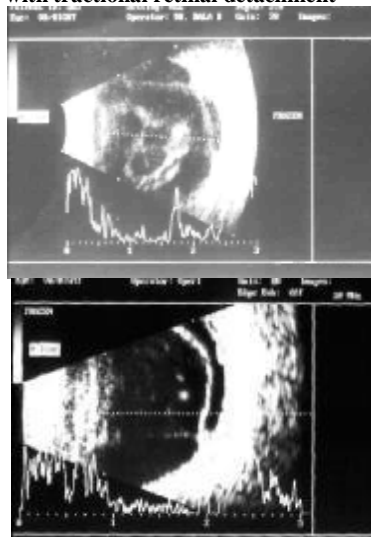
Figures no. 4. and 5. Ocular ecographies in hemophthalmus associated with tractional retinal detachment

hemophthalmus associated to tractional retinal detachment it should be operated as soon as possible, the access to the bottom of the eye being absolutely necessary to prevent the irreversible macular lesions that could determinate an aggravation of the diabetic retinopathy. In conclusion, with the increasing of the surgical performances it is imposed a change of the therapeutical conceptions regarding hemophthalmus in diabetic retinopathy. The vitreoretinal surgery isn't an ultimate precocious therapeutical alternative of those patients, a surgical approach allowing the majority of the cases an important, rapid unctional recovery.