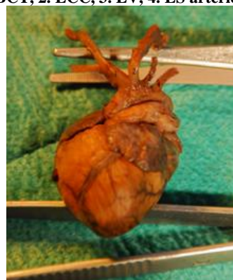
Figure no. 3. Fetal heart and aortic arch, 7 th month of gestation. 1. BCT, 2. LCC, 3. LV, 4. LS arteries

Also in one adult the LV artery originated from the aortic arch. The diameter of the aortic arch was 28 mm at the origin and 22mm in the isthmus segment. The BCT had a diameter of 14 mm, the LCC was 9mm in diameter and the LS 10 mm. The LV artery had a diameter of 3,7 mm.