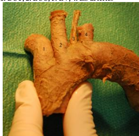
Figure no. 4. Aortic arch in adult showing the origin of LV artery 1. BCT, 2. LCC, 3. LV, 4. LS arteries

Also in one adult the LV artery originated from the aortic arch. The diameter of the aortic arch was 28 mm at the origin and 22mm in the isthmus segment. The BCT had a diameter of 14 mm, the LCC was 9mm in diameter and the LS 10 mm. The LV artery had a diameter of 3,7 mm.