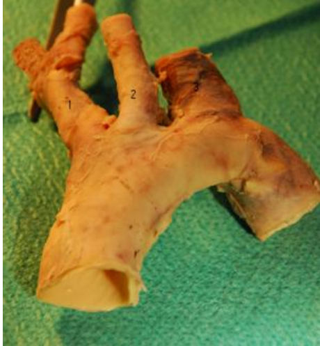
Figure no. 5. The aortic arch showing the LS artery as the largest branch. 1. BCT, 2. LCC, 3. LS arteries

The LCC artery was 7,5mm in diameter while the LS measured 13mm. The diameter of the aortic arch measured 23mm at the origin, and 20,5mm at the isthmus segment.