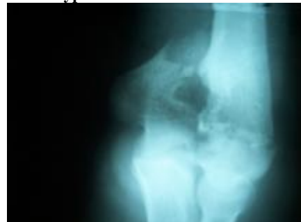
Figure no. 9. C3 type fracture

Because of the multifragmentary aspect of the fracture the external column wasn't fixed (fig.11,12).