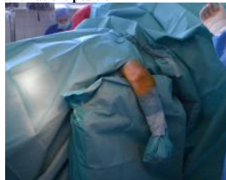
Figure no. 1. Patient position

Cut the superficial fascia and subcutaneous tissues. Found the cubital nerve and isolate it (Fig. 3) with a compress soaked with saline (note: do not turn the nerve when the compress is inserted.) or with a surgical marker. Make a flap with an incision along the medial edge of the triceps muscle. The incision have to interest all the tissues, including the periosteum. The incision crosses the cubital bone from the medial to lateral. Make the desinsertion of the triceps muscle with a fine chisel (fig.4)(do not use the scraper).