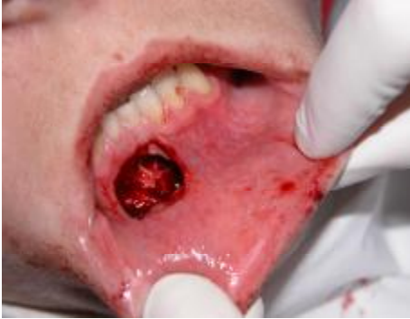
Figure no. 2. Clinical aspects after excision

Inclusion is due to the presence of a tumor consisting of isolated adult dental tissues and diffuses. By surgical intervention, we achieve the tumor and the included teeth removal.