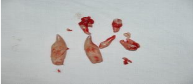
Figure no. 3. Odontogenic tumor and removed teeth (4.1.; 4.2.)

Surgery was performed under local anesthesia, postoperative evolution was favorable.