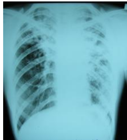
Figure no. 2 Multiple inhomogeneous, macro nodular opacities with diffuse contour, extended in both lung fields

The clinical, bacteriological and radiological aspects are progressively unfavorable, with poor outcome in treatment reinstated by the individual scheme. Therapy will again be abandoned by the patient after 5 months of reinstatement, death occurring during that year