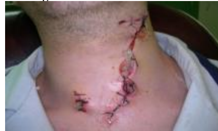
Figure no. 4. Surgical treatment

A favourable evolution of the disorder is represented by the appearance of pus, growing of the fever, and the disappearance of the toxic-septic phenomena. As the purulent secretion diminishes, the draining tubes can gradually be left aside or replaced by thinner tubes of polyten that help maintaining the draining paths and also allow the opened spaces to heal.