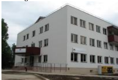
Figure no. 1. The building constructed from external funding

ü Another project obtained by „Dr. Constantin Gorgos” hospital was the NOKO7/RM/3/1 Project – „Pilot Intervention and Training Centre in Community Mental Health” . Following the signing of the Financing Agreement between the Ministry of Foreign Affairs of the Kingdom of the Netherlands and the Romanian Ministry of Health, TITAN „Dr. Constantin Gorgos” Psychiatric Hospital was mandated alongside the National Centre for Mental Health to implement the NOKO 7 /RM/3/1 Project – „Pilot Intervention and Training Centre in Community Mental Health”, monitored and coordinated by the Unit of Programme Implementation and Coordination.