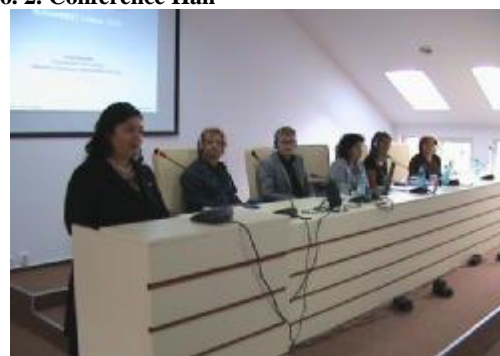
Figure no. 2. Conference Hall

The implementation of the project of the Intervention and Training Centre in Community Mental Health was carried out based on the Financing Agreement between the Ministry of Foreign Affairs of the Kingdom of the Netherlands and the Romanian Ministry of Health, signed on 01.10.2008, within the „Constituency Support Facility of Romania”, – project no. NOK 07 / RM / 3 / 1.