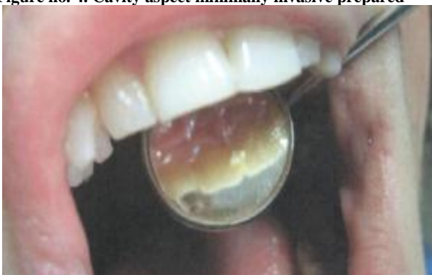
Figure no. 4. Cavity aspect minimally invasive prepared

After cavity conventional toilet with hydrogen peroxide, I moderately dry it and hybridized the dental wound with adhesive composite kit Point 4 (Kerr Hawe).