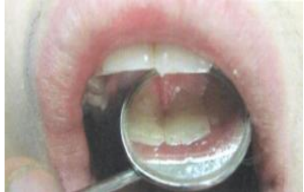
Figure no. 5. Final aspect of the accomplished restoration

For longer maintaining the treatment results, the patient was counselled regarding the control of the risk factors to caries.