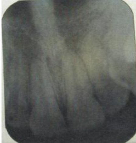
Figure no. 3. Radiographic aspect of decay processes

To prepare cavities in this case, I chose to remove the minimum layer from 0.25 to 0.50 mm of enamel incisal third marginal ridges (due to the particular location of the carious process) with a pear-shaped diamond cutters.