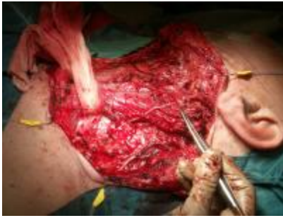
Figure no. 2. Modified radical neck dissection

Selective neck dissection refers at removal of the primary tumour according to the process topography, only of the lymph nodes groups involved.(3) It presents 4 subtypes: