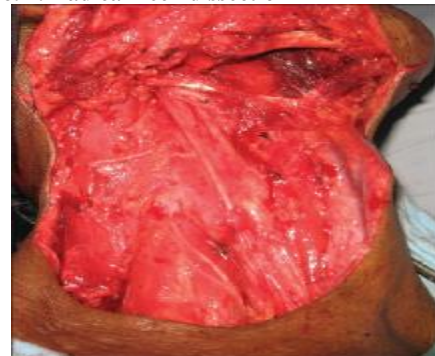
Figure no. 1. Radical neck dissection

This type of neck dissection removes completely the lymphatic fat tissue from the clavicle to the mandible, respectively from the anterior margin of the trapezius muscle (posterior) to the midline of the neck, but also retains some cervical lymph node groups such as the parotid, suboccipital, retropharyngeal, paratracheal or superior mediastinal lymph nodes, failing to achieve their removal.(3)