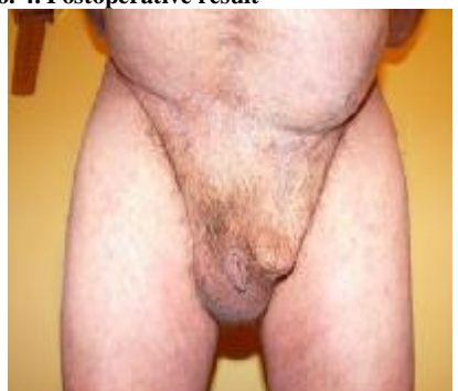
Figure no. 4. Postoperative result

The postoperative evolution was without complications. Later, at an interval of two months, we practiced the left inguinal hernia cure - Lichtenstein procedure (with mesh), which went without incidents. 4 years after the first surgery, the patient presents a good biological condition without relapse signs with normal physical activity and urinary and sexual functions in physiological limits (figure no. 4).