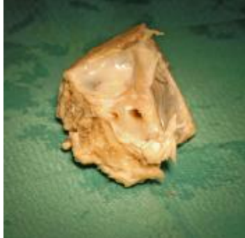
Figure no. 1. The left temporal bone harvested from the human subject

Heredo-collateral antecedents: irrelevant.