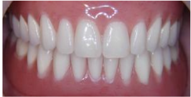
Figure no. 5. Harmonious aspect of the two complete dentures in occlusion

The function and aesthetic of the patient had been monitored at 1 month, 6 month, 1 year and 2 years (figure no. 5).