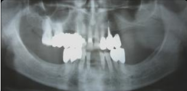
Figure no. 2. Panoramic X-ray of initial dental status

The dental technician assembled the upper central incisors on the maxillary wax occlusal rim to verify the right dimension of the teeth.