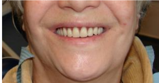
Figure no. 4. Beautiful natural smile after oral rehabilitation

The function and aesthetic of the patient had been monitored at 1 month, 6 month, 1 year and 2 years (figure no. 5).