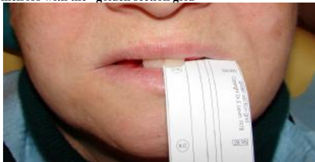
Figure no. 3. Verifying the choice of the upper central incisors with the “golden section grid”

Using the “golden proportion grid” the dental technician mounted the artificial teeth on the complete denture obtaining a natural smile (figure no. 4).(1-5)