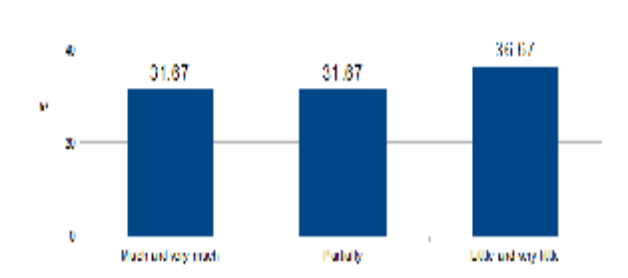
Figure no. 2. Opinions about replacing English-speaking people and characters in order to facilitate understanding