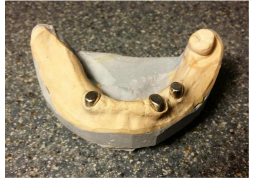
Figure no. 17. The cast post and cores cemented on teeth

Figure no. 16. The cast post and cores processed and polished