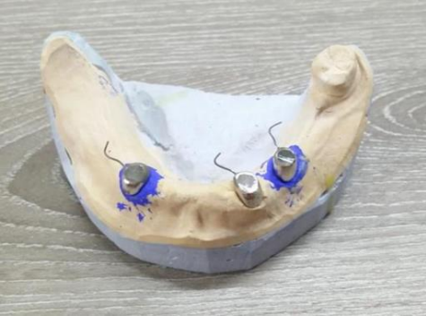
Figure no. 16. The cast post and cores processed and polished

Figure no. 15. The cast post and cores adapted on the master cast