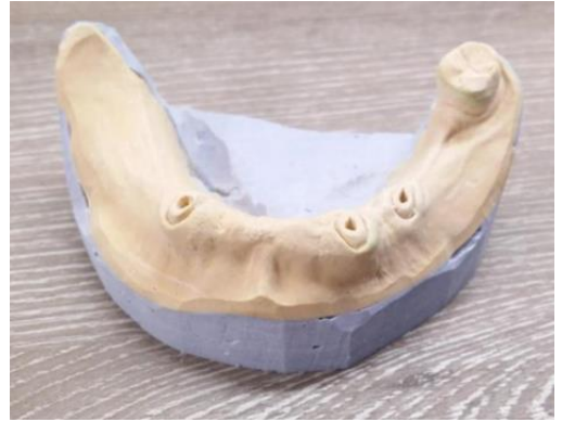
Figure no. 11. Mandibular master cast

To solve this case, 3 800-gram force Magfit DX magnetic systems from AICH EUROPE Gmbh were used. These have been incorporated into the wax pattern of cast post and core made on the master cast.