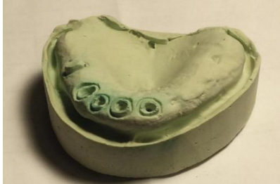
Figure no. 1. Maxillary master cast

Four 800-gram force Magfit DX magnetic systems from AICH EUROPE Gmbh were used. These were incorporated in the models of cast post and core made on the master model.