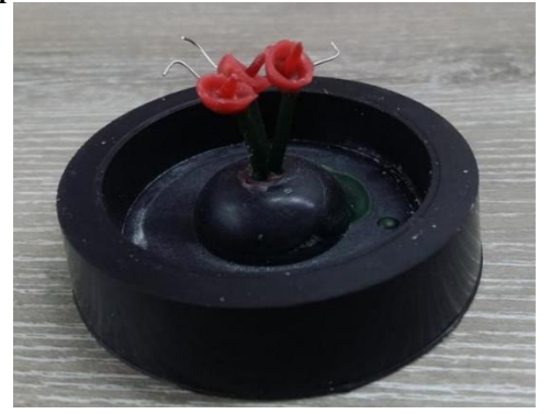
Figure no. 14. Cast post and cores after deflasking and sandblasting. Next, the metal sprues are cutted and final products processed

Figure no. 13. Wax pattern of cast post and core attached with sprues to crucible former