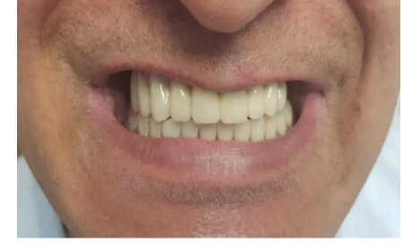
Figure no. 19. Mandibular overdenture with magnets mounted on the mucosal surface, in occlusion.

The patient wore the dentures for accommodation for a short period of time. In a subsequent visit made to the dentist's office, the magnets were permanently mounted in the mucosal area of the denture.