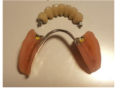
Figure no. 9. Complete maxillary overdenture processed and polished