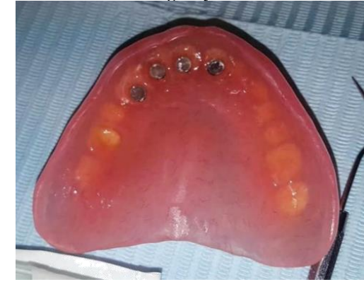
Figure no. 10. Magnets glued in the mucosal cavities of the overdenture with self-curing acrylate

The patient wore the dentures for accommodation for a short period of time, and then, in a subsequent visit to the dentist's office, the magnets were permanently mounted in the mucosal surface of the denture, using self-curing acrylate for gluing them.