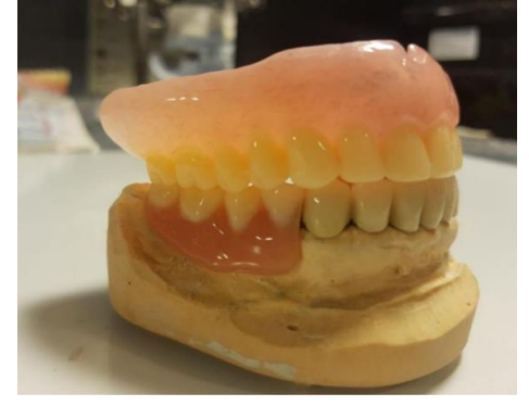
Figure no. 8. Mandibular prosthetic restorations

Figure no. 7. Maxillary and mandibular prosthetic restorations on the master cast, after processing and polishing