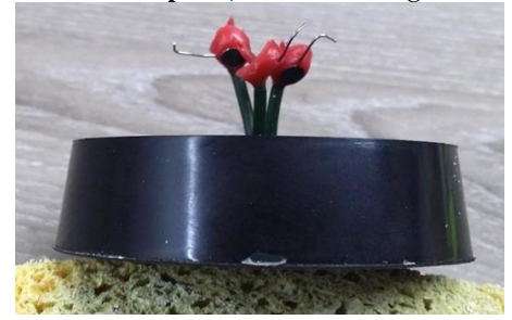
Figure no. 3. Cast post and cores after deflasking and sandblasting

Figure no. 2. Wax patterns of cast post and core attached to crucible former with sprues, before investing